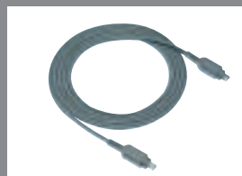
VMC-IL4408A/4415/ 4435 i.LINK Cable (4-pin to 4-pin)