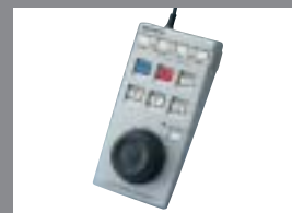
DSRM-20 Remote Control Unit